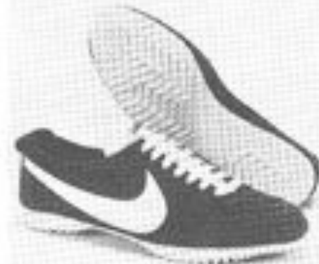
ROAD RUNNER — Suede racing flat $21.80