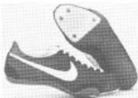
AMERICAS — Nylon racing spike $29.10