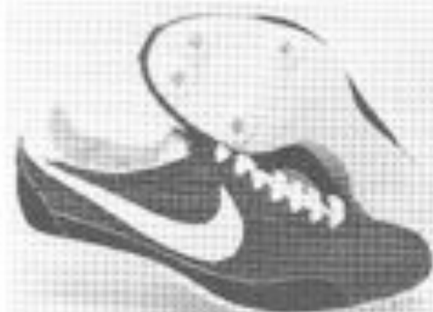
INTERVALLE — Nylon training spike $26.00