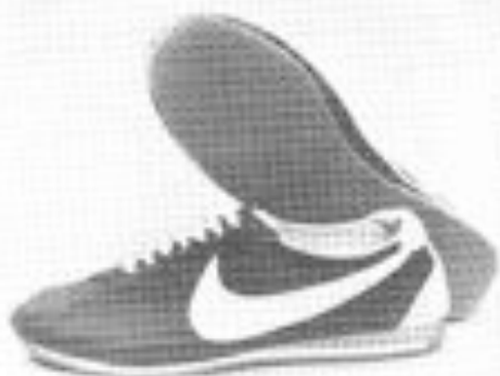
BOSTON '72 — Nylon distance racing flat $19.25