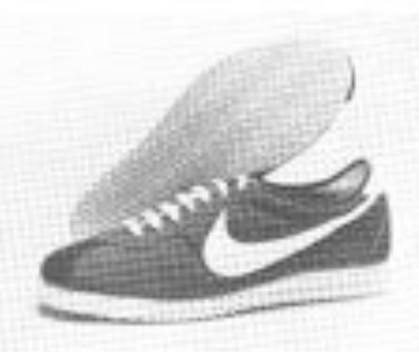
FINLAND BLUE (Kenya red) — Nylon racing and training flat $20.00