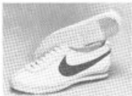
LEATHER CORTEZ — Distance training $26.45