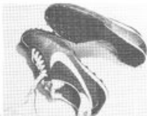
OREGON WAFFLE — Nylon racing flat $22.98