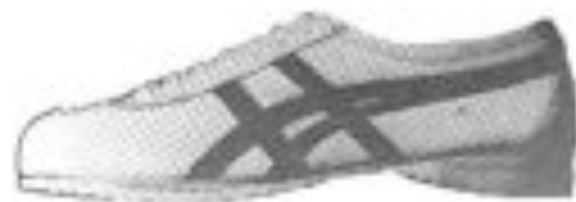
TG-22 "ROAD RUNNER" $11.95

The lightest, fastest, strongest, most comfortable flat ever made. The king of racing shoes, without an equal, without a challenger.