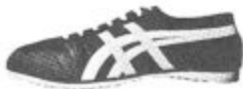
TG-4 "MARATHON" NEW ALL-NYLON UPPER $ 10.95

The lightest, fastest, strongest, most comfortable flat ever made. The king of racing shoes, without an equal, without a challenger.