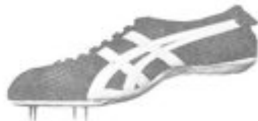
"OLYMPIADE XIX" $ 16.95

The ideal racing/training combination shoe. Special sponge midsoles absorb road shock at ball and heel. New long wearing outer sole and sponge cushioned tongue. Lightweight buffed calf uppers.