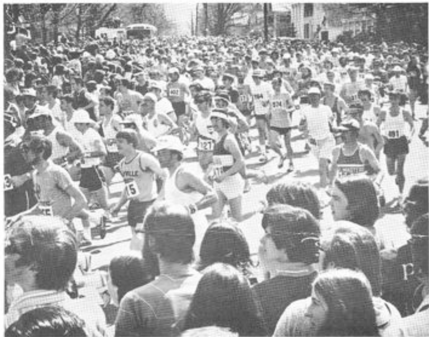
BOSTON MARATHON - View of part of the pack rounding the first turn shortly after the start.