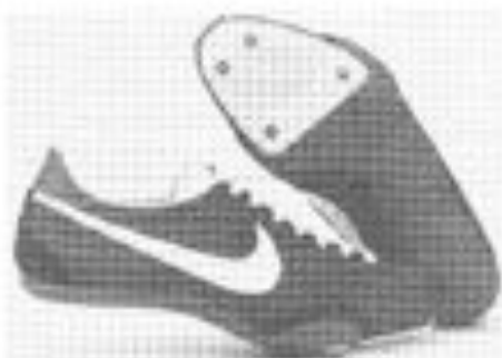
AMERICAS — Nylon racing spike $29.10