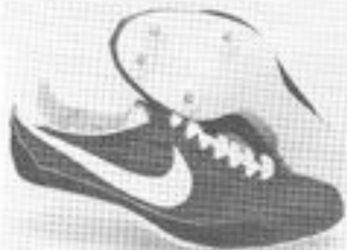
INTERVALLE — Nylon training spike $26.55