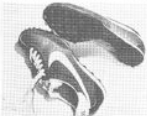
OREGON WAFFLE — Nylon racing flat $23.35