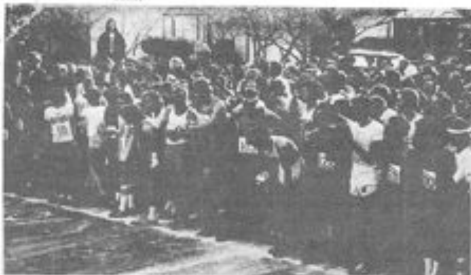
THE START OF THE 1974 SENIOR NATIONAL WOMEN'S MARATHON &amp; WEST VALLEY MARATHON.