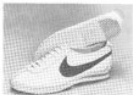
LEATHER CORTEZ — Distance training $25.45