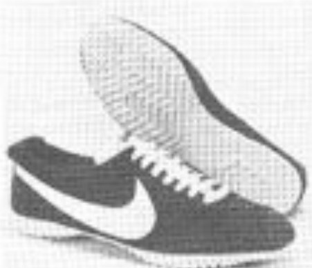
ROAD RUNNER — Swede racing flat $21.80