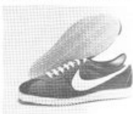
FINLAND BLUE (Kenya red) — Nylon racing and training flat $20.00