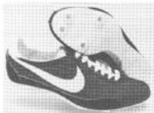
INTERVALLE — Nylon training spike $26.55