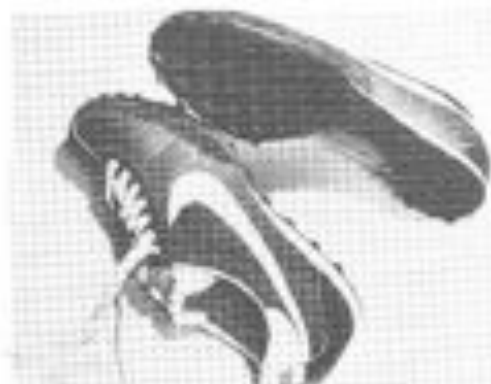
OREGON WAFFLE — Nylon racing flat $22.35