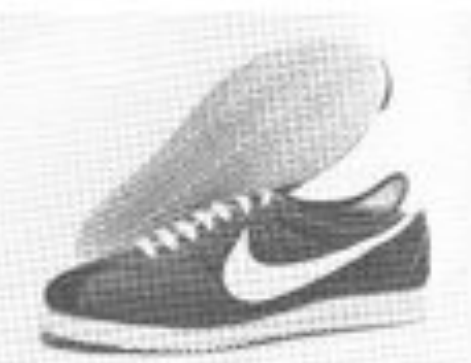
FINLAND BLUE (Karys heel) — Nylon racing and training flat $20.00