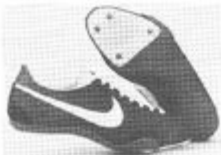
AMERICAS — Nylon racing spike $20.10