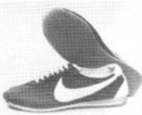
BOSTON '73 — Nylon distance racing flat $19.25