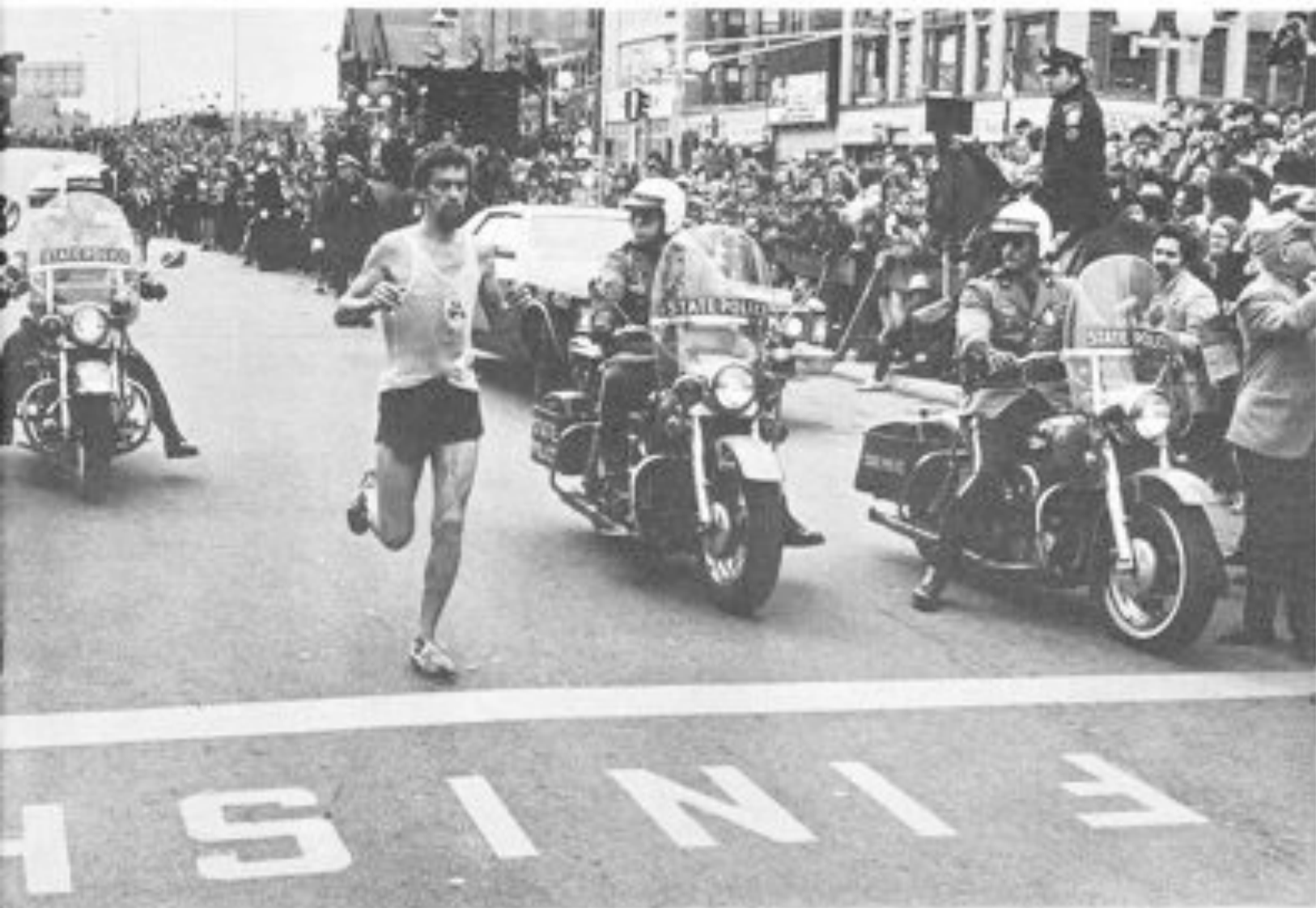
NEIL CUSACK wins the Boston Marathon.