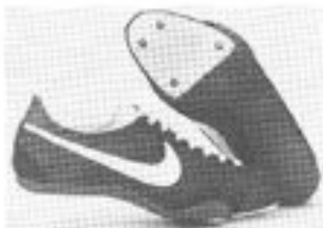
AMERICAS — Nylon racing spike $29.92