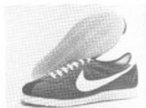
FINLAND BLUE (Kenya red) — Nylon racing and training flat $20.00