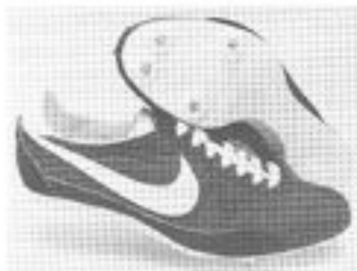
INTERVALLE — Nylon training spike $26.88