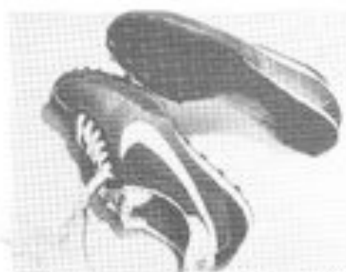
OREGON WAFFLE — Nylon racing flat $22.28