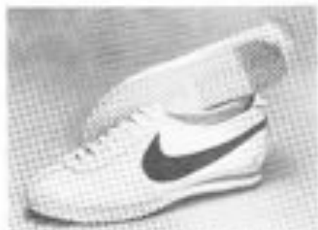
LEATHER CORTEZ — Distance training $25.48