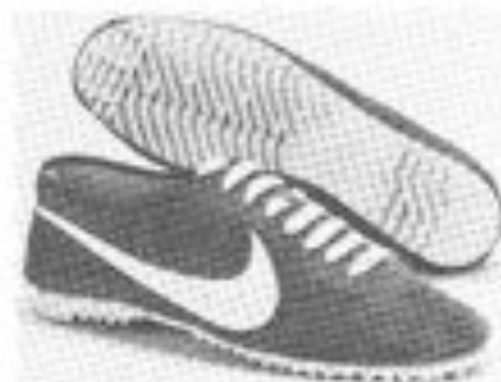
MARATHON — Nylon racing flat $13.88