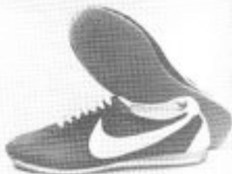
BOSTON '73 — Nylon distance racing flat $19.28