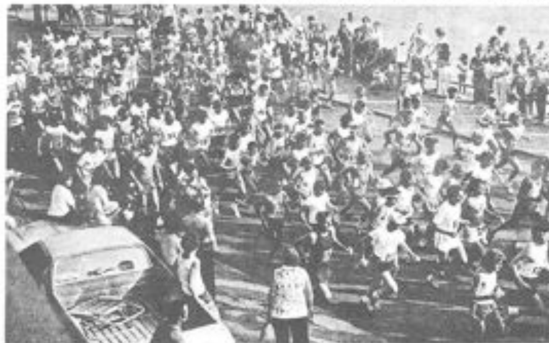
THEY'RE OFF and running in the Koch Brewery-Fredonia Farm Festival's 10 K (6.2 mile) Road Race Saturday evening in Fredonia. Approximately 240 runners

EVENING OBSERVER, Dunkirk-Fredonia, N. Y. Monday, August 18,