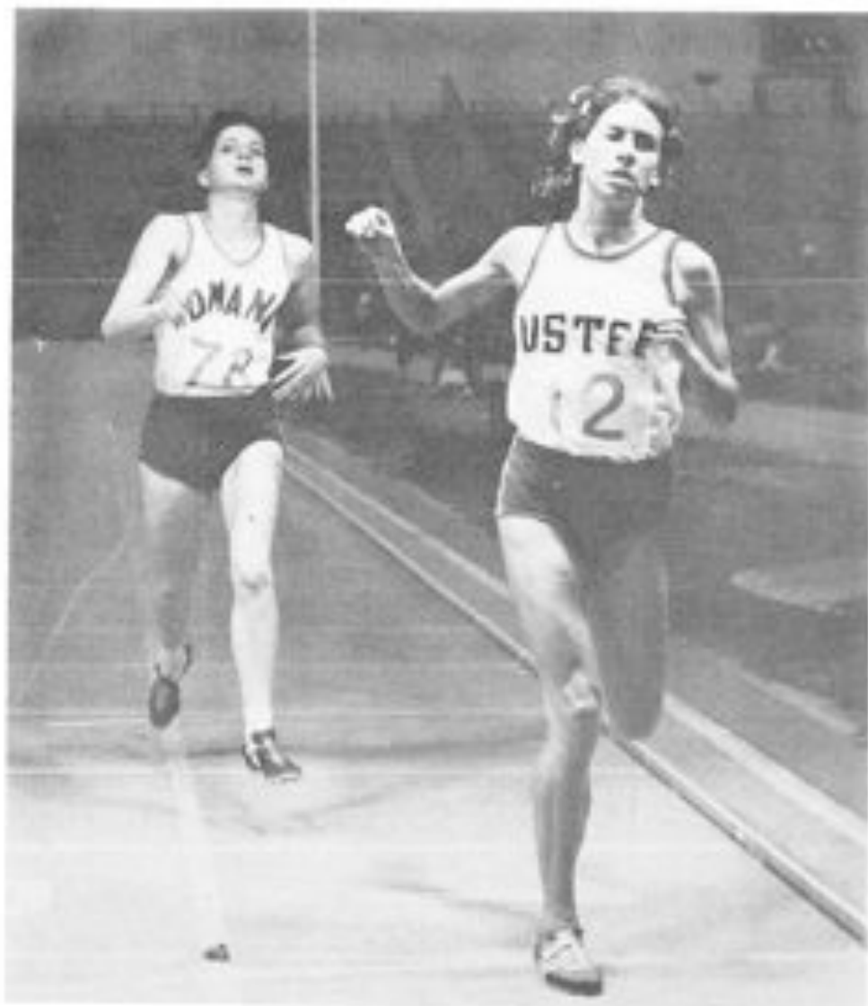
Francie Larrieu (Pacific Coast Club) winning 1500 meter at Athens, Greece in July 1975, wearing USTFF uniform.