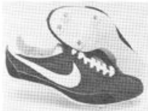
INTERVALLE — Nylon training spike $26.65