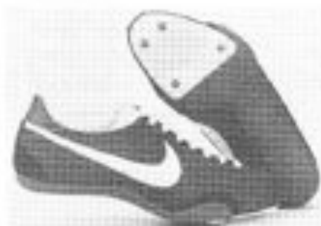
AMERICAS — Nylon racing spike $29.10