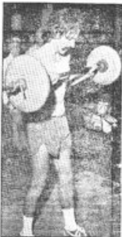
The final test.