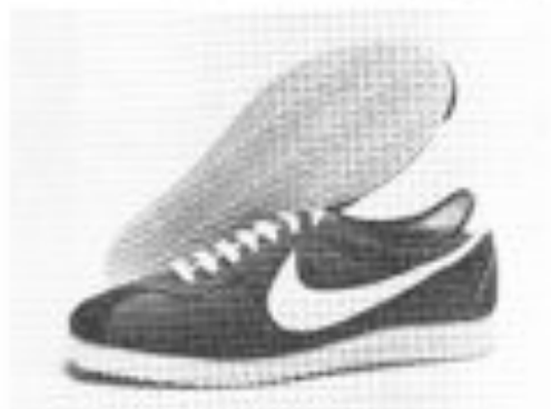
FINLAND BLUE (Kenya red) — Nylon racing and training flat $20.00