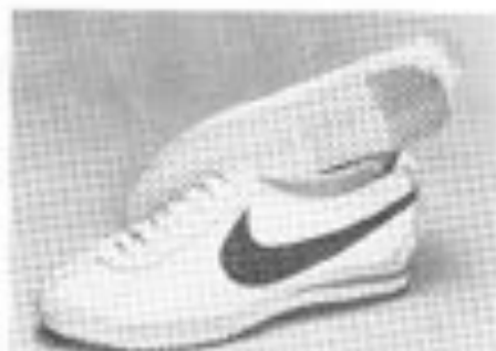
LEATHER CORTEZ — Distance training $25.45