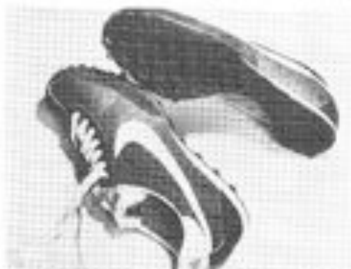
OREGON WAFFLE — Nylon racing flat $22.38