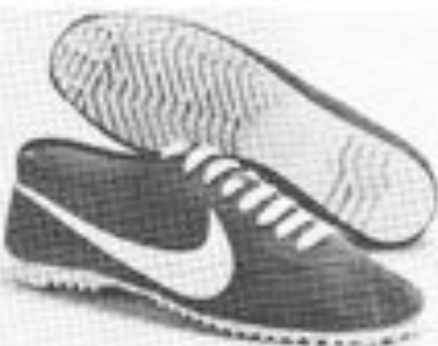
MARATHON — Nylon running flat $15.65