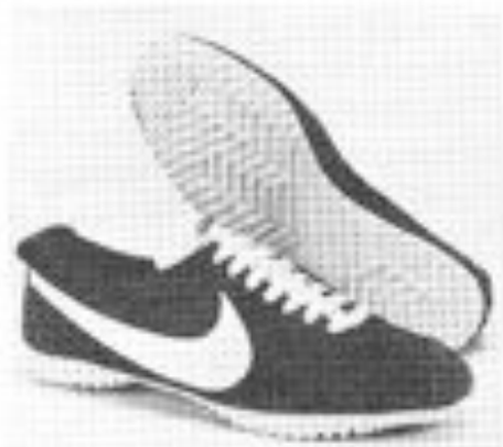
ROAD RUNNER — Suede racing flat $21.80