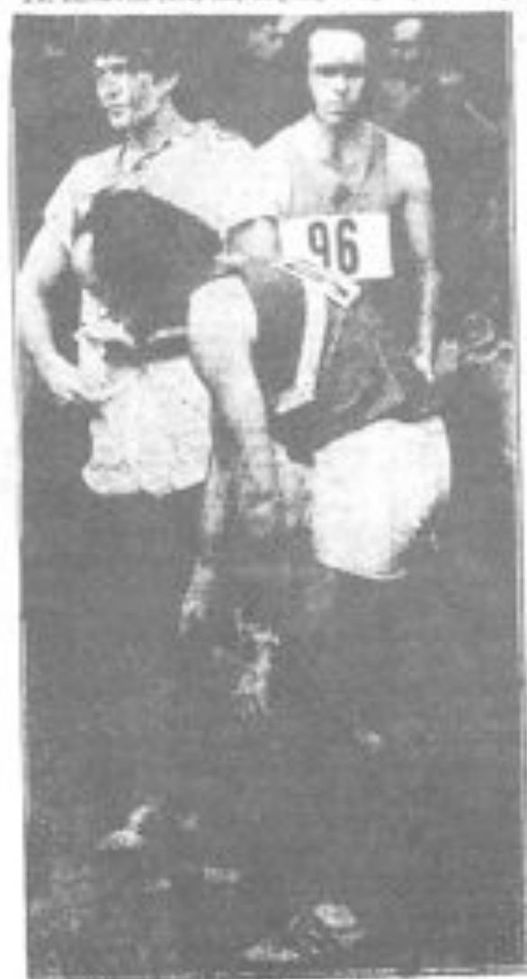
Water Bolt's Segal (Love Story) stripes for action.