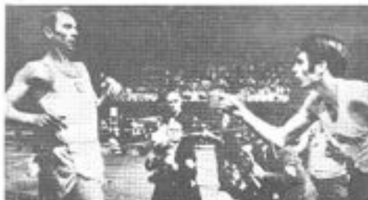
Liquori vehemently accuses Polish miler Henry Szardylowski of crowding him on the last lap of a race at Madison Square Garden. Videotapes later supported Liquori's claim.

ORDER YOUR TIGER, REEBOK AND NEW BALANCE RUNNING SHOES FROM TRACK & FIELD SPORT CENTER; ALSO AVAILABLE - MUNICH '72 OLYMPIC SHIRTS; TIGER SHIRTS; NYLON SHORTS