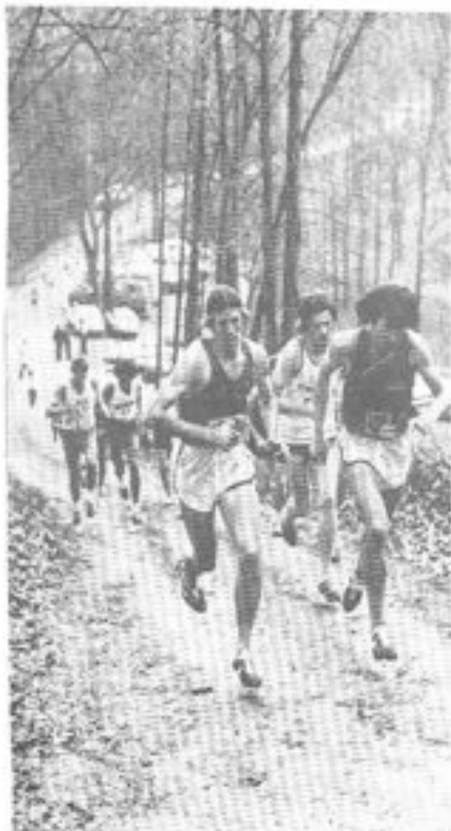
Steep Hill Offers Rugged Test in 6-Mile Race