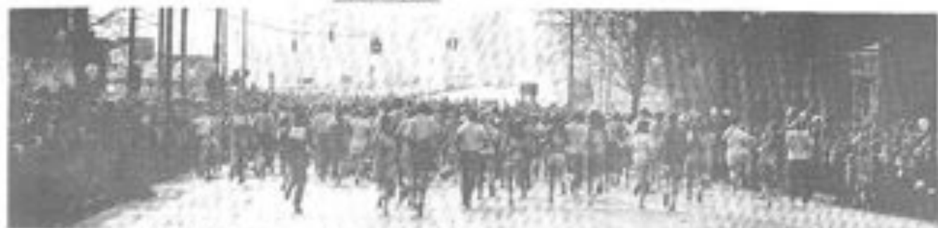
GOING: Mass Start of Record Road Race Field Shortly After Gun Sounded