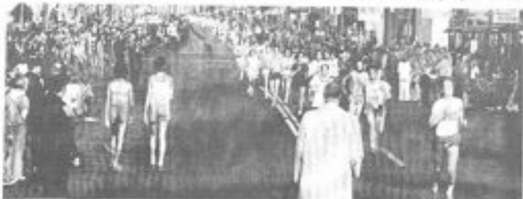
COMING: Steady Stream of Finishers Coming Down Main Street